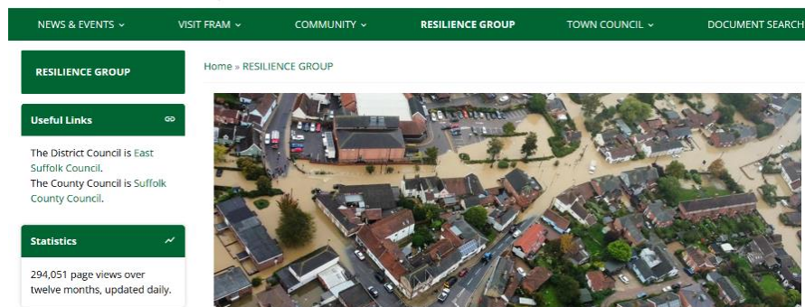
Framlingham Flood Resilience & Recovery

THE OFFICIAL WEBSITE FOR FRAMLINGHAM, SUFFOLK, UK