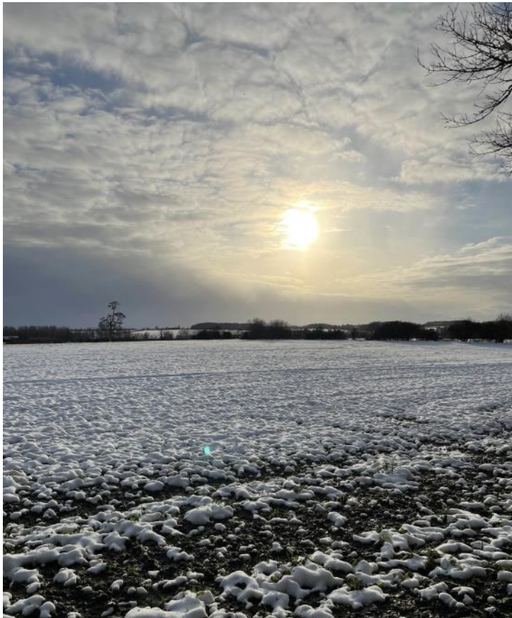
A wintry sunrise over Easton fields.