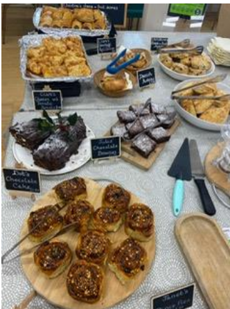
Sunday Café is sponsored by Easton Church

Please Note: There will always be someone from the Parish Council at the Sunday Café if anyone wishes to address any issues they may have.